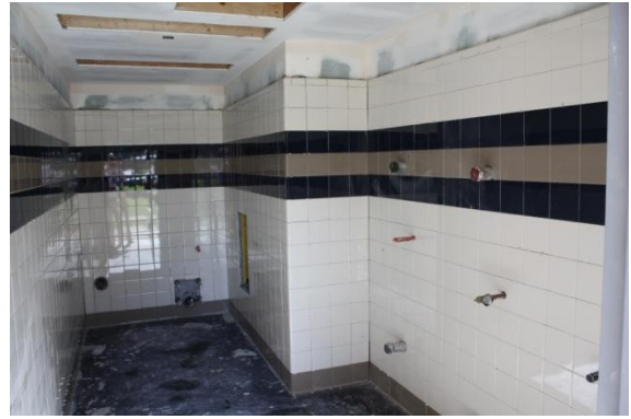
...now covered with shiny new tile!