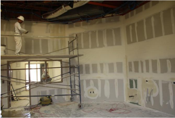
Drywall finishing of new Science Lab