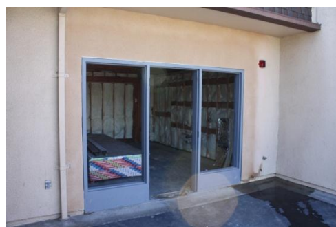
Office Doorway & Window Installation