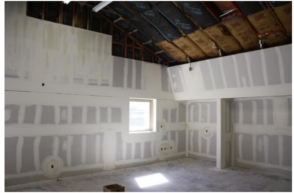
Next steps: Paint & Wall Paper