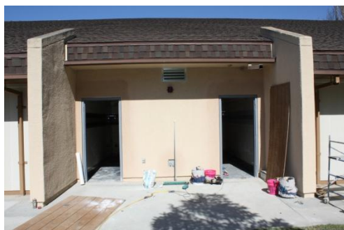
Framed doorways to the new restrooms