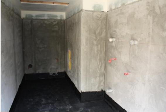
Stucco walls in the new boys bathrooms...