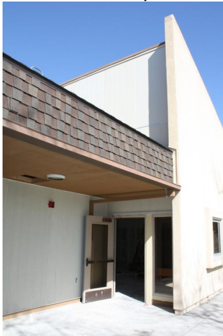
New exterior siding